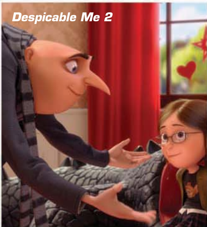
Despicable Me 2

Buzz: Goodman and Crystal recorded their lines together in the same room so they could get the right chemistry between their characters.