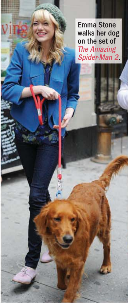
Emma Stone walks her dog on the set of The Amazing Spider-Man 2 .