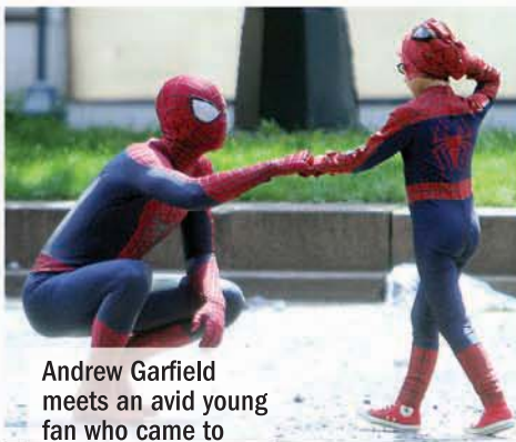
Andrew Garfield meets an avid young fan who came to visit the set of The Amazing Spider-Man 2 dressed as Spider-Man himself.