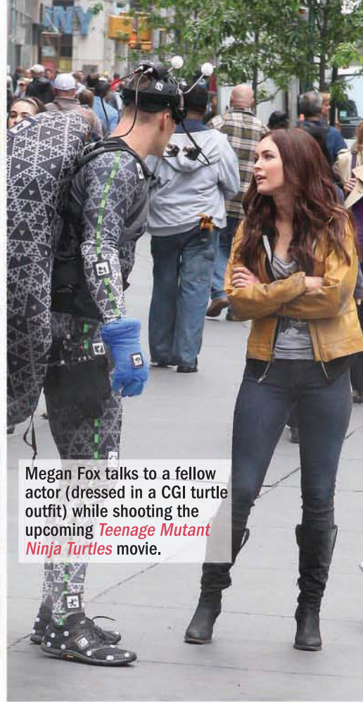
Megan Fox talks to a fellow actor (dressed in a CGI turtle outfit) while shooting the upcoming Teenage Mutant Ninja Turtles movie.