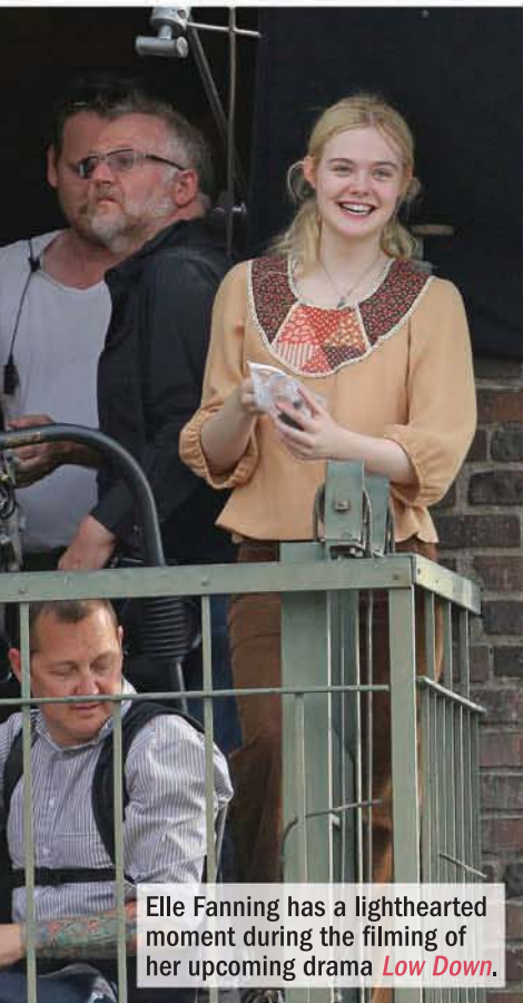
Elle Fanning has a lighthearted moment during the filming of her upcoming drama Low Down .