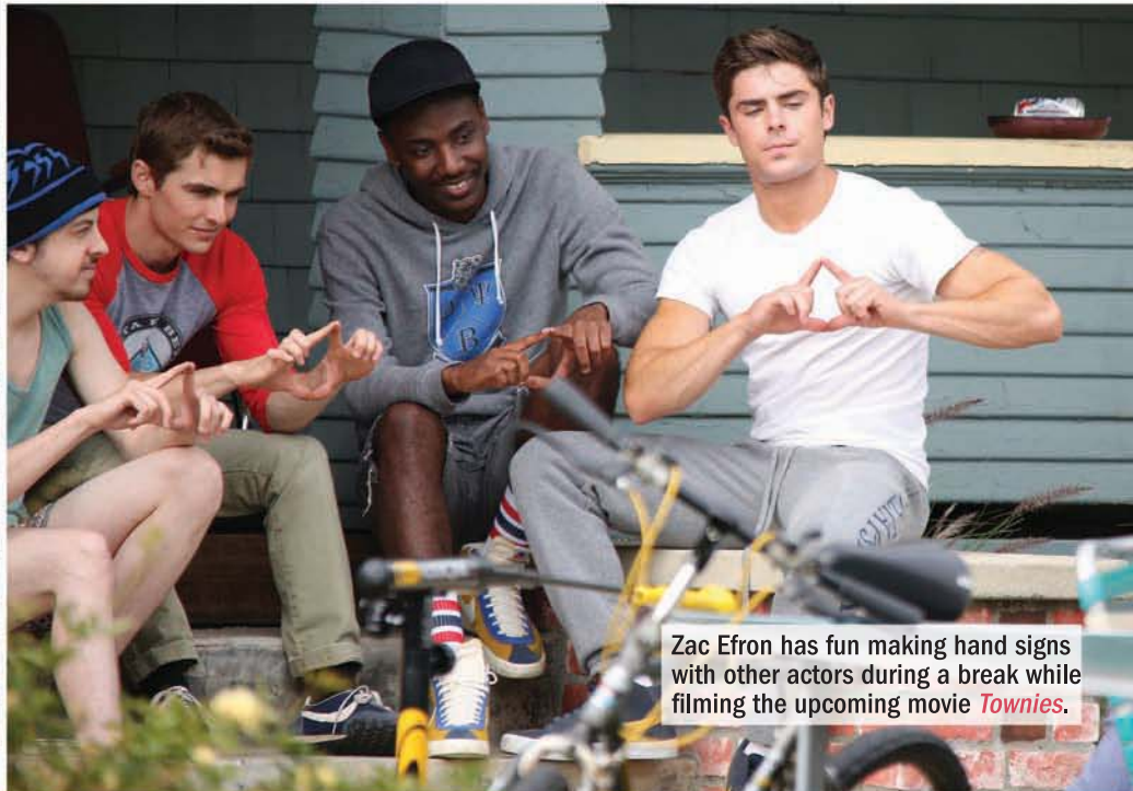
Zac Efron has fun making hand signs with other actors during a break while filming the upcoming movie Townies .