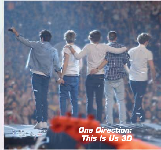
One Direction: This Is Us 3D

August 21, Action Lily Collins, Jamie Campbell Bower, Kevin Zegers, Jonathan Rhys Meyers After Clary Fray's (Collins) mother is taken from her home, Clary learns the truth about her supernatural family and goes on a quest to get her mother back. Buzz: Magic Mike star Alex Pettyfer turned down the role of Jace Wayland, which eventually went to Jamie Campbell Bower.