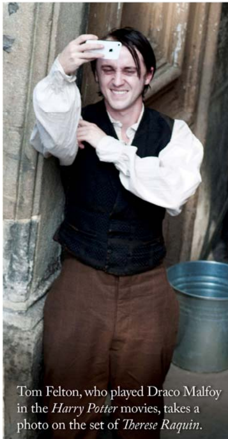
Tom Felton, who played Draco Malfoy in the Harry Potter movies, takes a photo on the set of Therese Raquin .