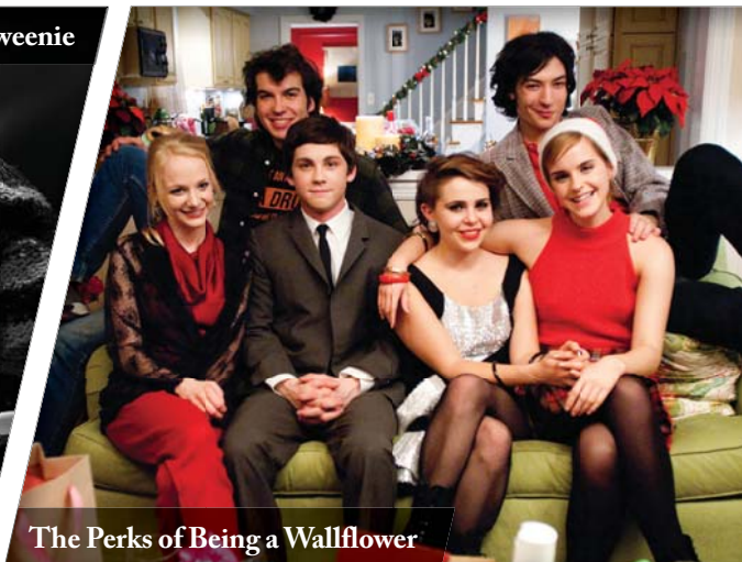
The Perks of Being a Wallflower