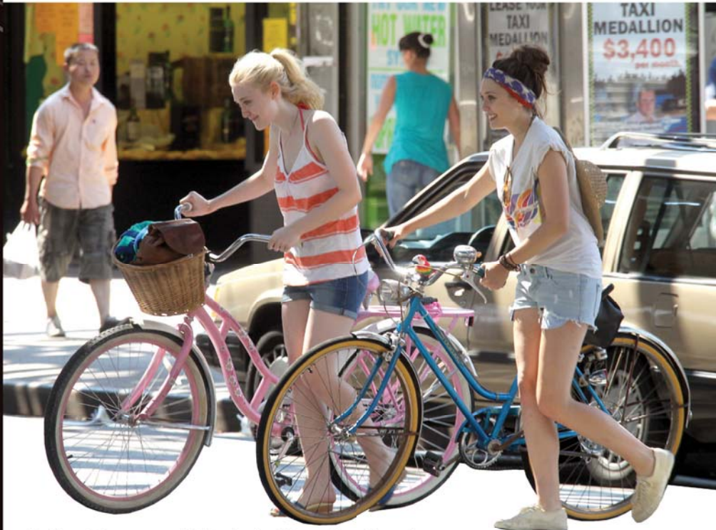
Dakota Fanning and Elizabeth Olsen film a bicycle scene on the set of the drama Very Good Girls in Brooklyn.